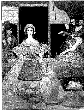
Poe published "The Mystery of Marie Roget" in 1850.