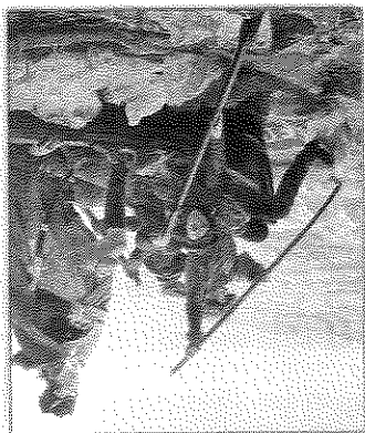
On the night of December 25, 1776, Washington and his troops crossed the Delaware River into New Jersey to surprise the British forces.

15. Our supervisor acts calm most of the time, but we have learned that he has a very (orthodox, inflammable) temper.